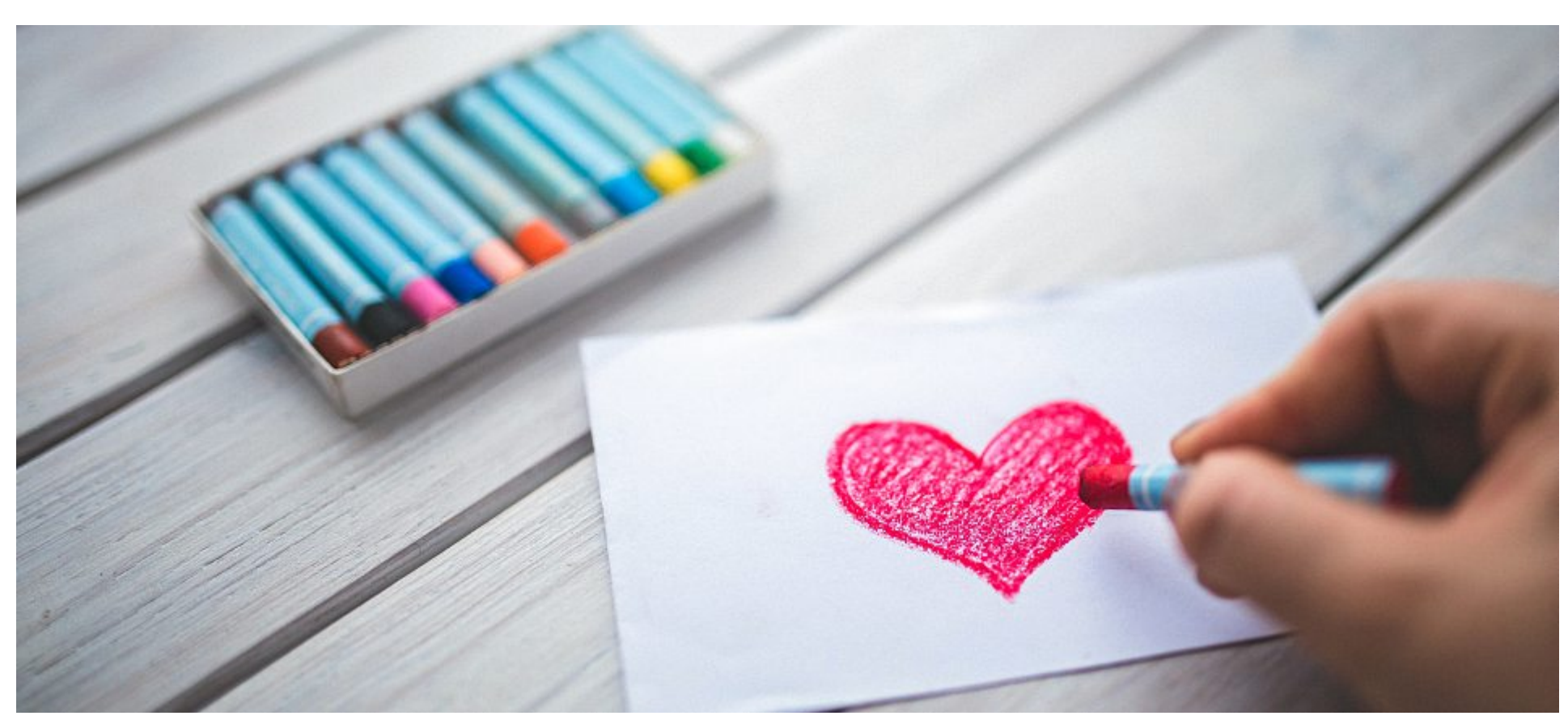
Learn to speak your partner's love language so you both feel truly loved by one another.